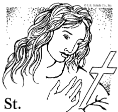
St. Mary Magdalene

Lord Jesus, I would have chosen, like Mary, to sit all day long in peace at your feet and listen to the silence of my heart. But you came into my house with all your friends who kept me busy, and I served them for love of you. If I cannot offer you the eyes of Mary, accept at least, I pray you, the tired hands of Martha. They are my love for you.